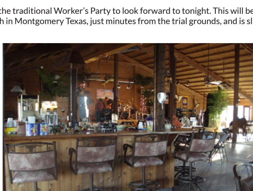
Berkley Party Barn is prepped for the Worker's Party