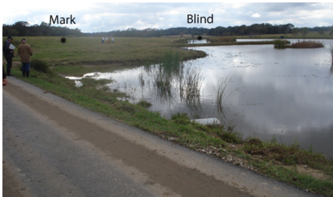
5th & 6th Series - view from mat on the road

The 5th and 6th Series are combined. There is a Water Blind, which is considered the 5th Series, and a land mark (shot flyer), which is considered the 6th Series. The flyer is located to the left of the water and the blind and is thrown from right to left. As the flyer is shot, the handler and dog watch from a mat that is up on a paved road. They then move back about 10 yards to another mat that is down on the grass. From here, the handler sends the dog for the blind. This blind is about 200 yards from the sending mat on the shore of the pond. The line to the blind is across the road, into the water, up onto a small point, back into the water, up onto a larger point, then back into the water. Handlers may not move up to the road to handle their dogs until the dog has gone beyond a boat on the 1st land point. Once the dog has returned to the line, the handler receives the bird on the mat from which they watched the flyer. From this same mat, the handler sends the dog for the mark.