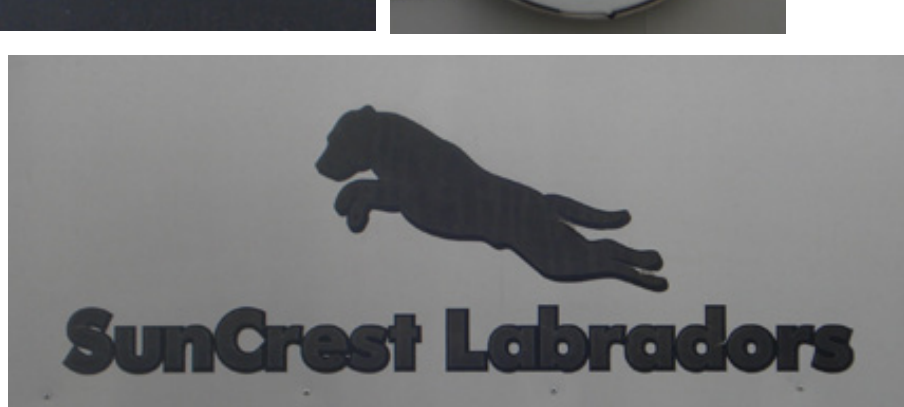
Just some of the kennels represented at this year's National Retriever Championship