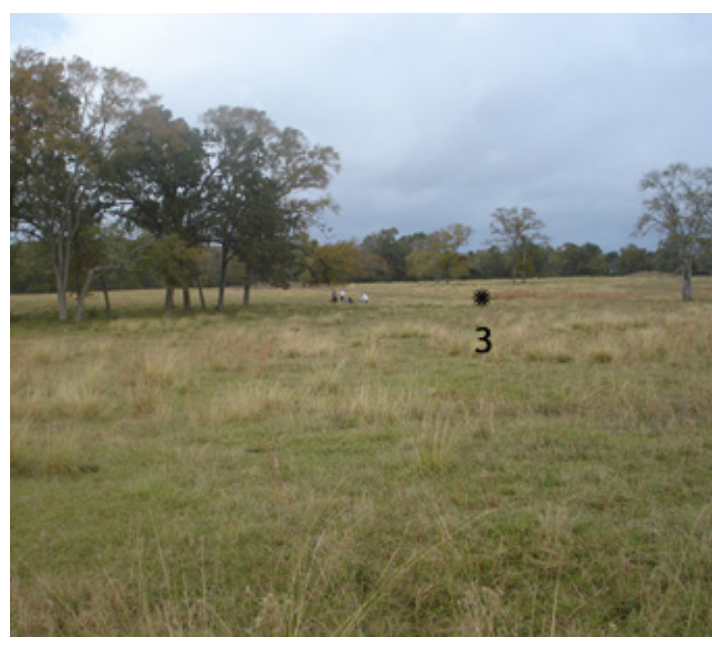
Test 4 - View from the line

Just before 11:00, the test dog team of Ty Rorem and Jazz came to the line. The handlers gathered round and watched as Ty sent Jazz to all three marks without a single handle.